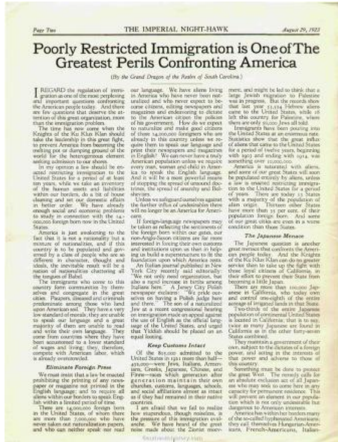
The Imperial Night-Hawk was the official organ of the Ku Klux Klan

Source material for the collection is scattered across multiple holding libraries, museums and private collections, including: Atlanta History Center, Bowling Green State University, California State University Northridge, Central Michigan University, Colorado Historical Society, Duke University, Emory University, Indiana Historical Society, Michigan State University, Minnesota Historical Society, Montana Historical Society, New York Public Library, Ohio Historical Society, Oregon Historical Society, Pennsylvania State Library, Princeton University, University of Oklahoma, University of Georgia, University of Oregon, University of Texas, University of Wisconsin, Wisconsin Historical Society, and Wichita State University.