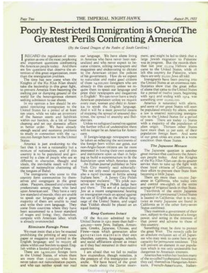
The Imperial Night-Hawk was the official organ of the Ku Klux Klan