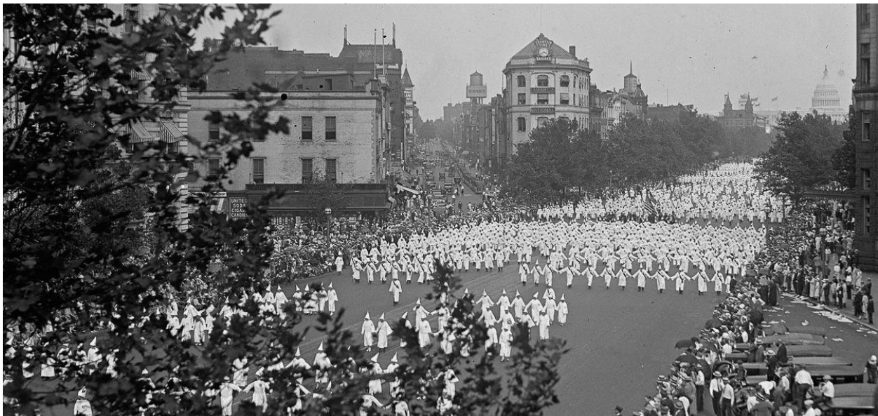
Klan members march down Pennsylvania Avenue in Washington, D.C. in 1925

An Open Access Collection from REVEAL DIGITAL